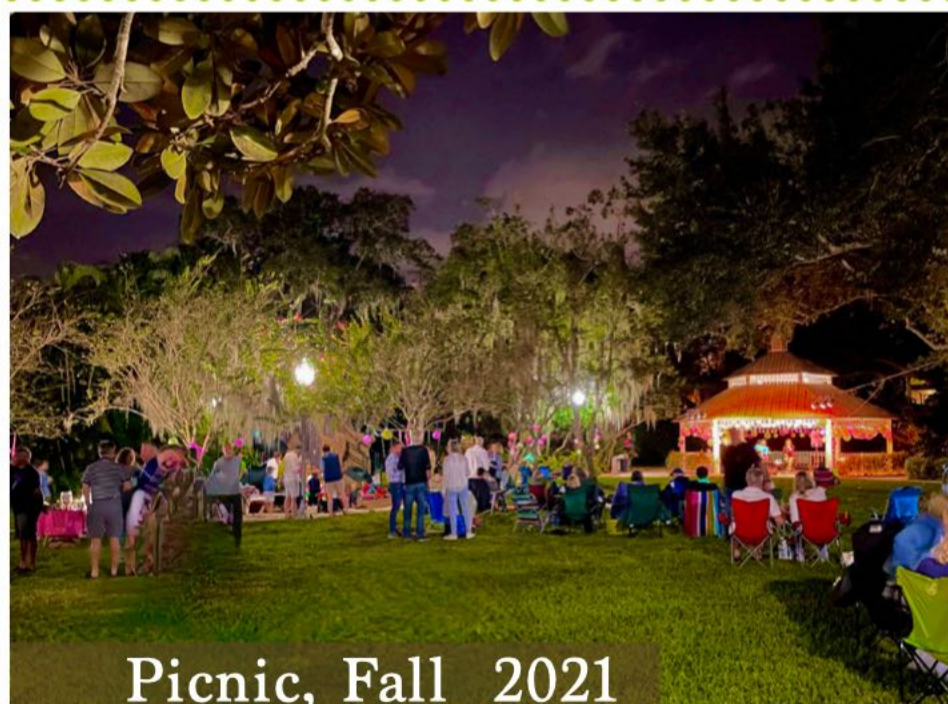
Picnic, Fall 2021

The developer for the LaVerne Assisted Living Community submitted a building permit in mid October and will be in the market for final construction costs by the end of the month. Those two processes will run parallel and we understand they intend to break ground early next year. The construction timeline should be about 24 months.