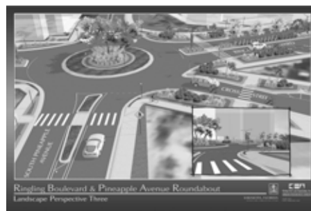
Roundabout plan includes Cross Street.

LPNA has taken no position on the issue but will notify the neighborhood of any developments or meetings.