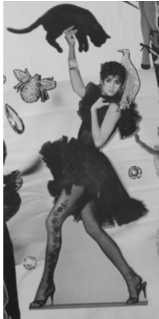
Portion of a Wilda collage