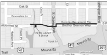
Area of planned MURT improvements.

Laurel Park will soon be undergoing a renovation: the City of Sarasota and Sarasota County will be developing the Multi-Use Recreational Trail (MURT) along the southern edge of Laurel Park.